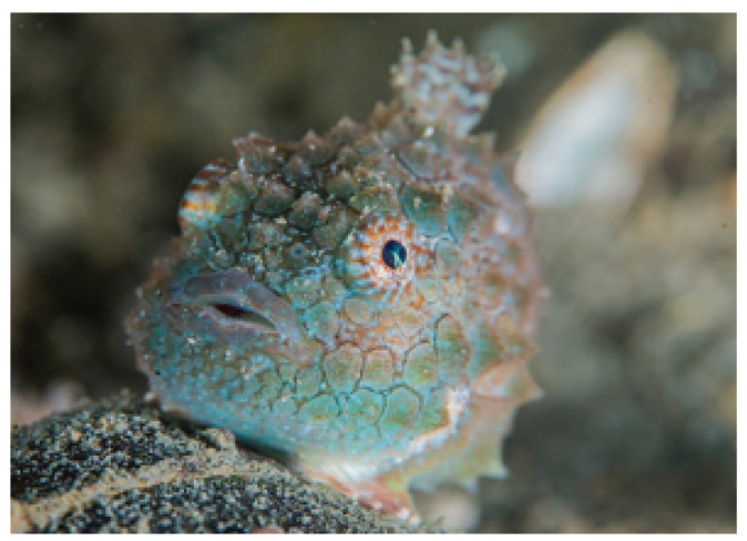
Pacific Spiny Lumpsucker,

Many of us would agree that the chilly waters around Vancouver would not be our top scuba diving destination. However, the organisms that live just off the shore at Stanley Park are just as amazing as in other parts of the world. One such critter that can be found along the Strait of Georgia and Puget Sound is the Pacific Spiny Lumpsucker, otherwise known as Eumicrotremus orbis. Although its name lacks in creativity, it sure is accurate. "A ping-pong ball with tiny fins" may as well be the best description of this minuscule fish native to the Pacific Northwest. It is truly one of those animals that are able to oddly meld the utterly adorable and downright ugly into something that is so incredibly unique.